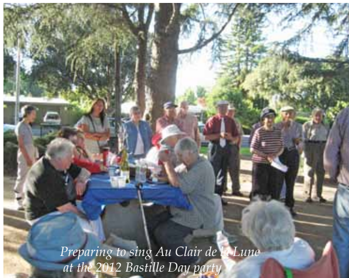
Preparing to sing Au Clair de la Lune at the 2012 Bastille Day party