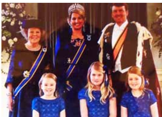
The new Dutch king and his family with his mother, the former Queen, at top left.