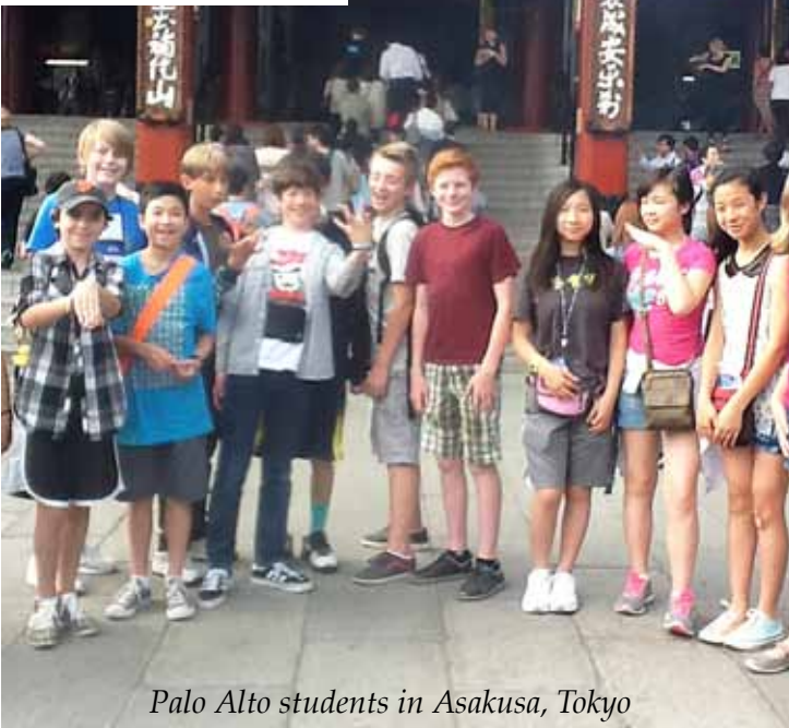
Palo Alto students in Asakusa, Tokyo