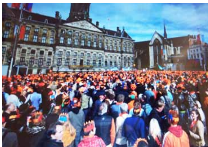
Crowd in Dam Square in Amsterdam on Queen's Day 2013.