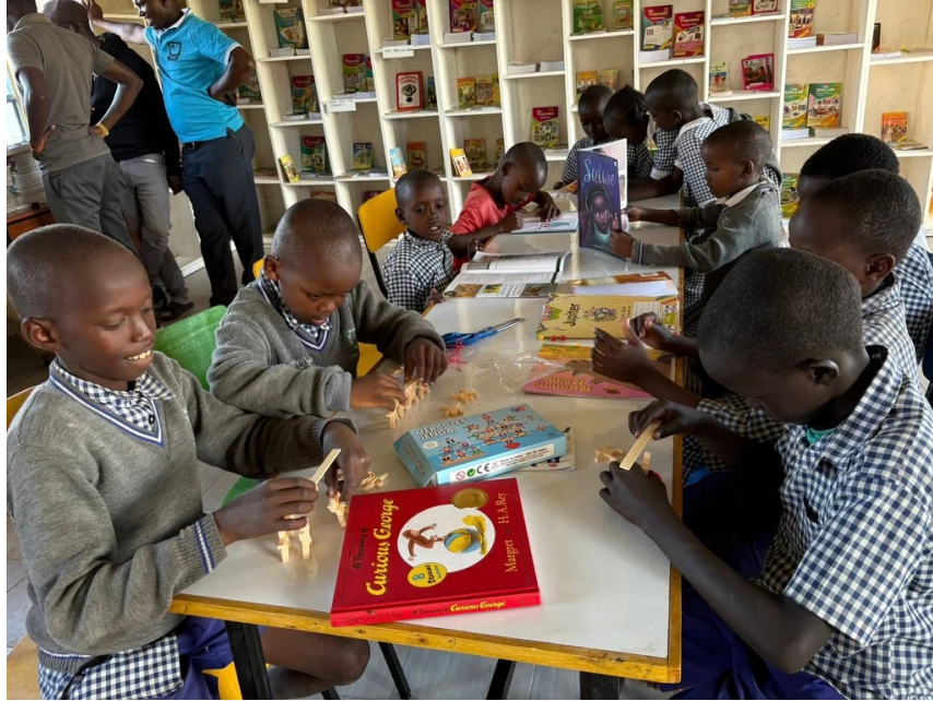
Local children have fun at the launch of the new library.