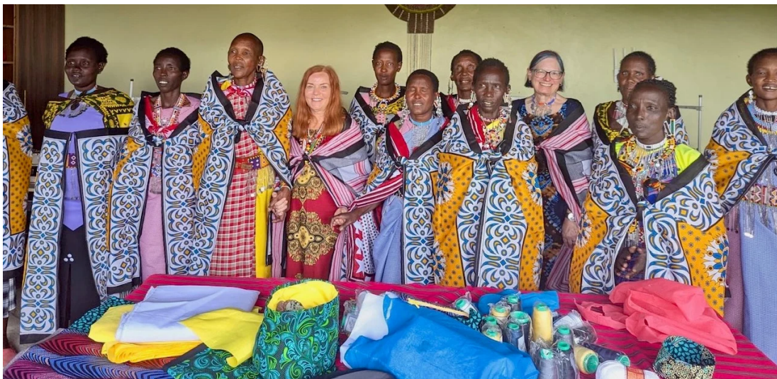
In mid-March, a Neighbors Abroad

Neighbors Abroad Helps Launch New Children's Library with Nonprofit Oliveseed Foundation