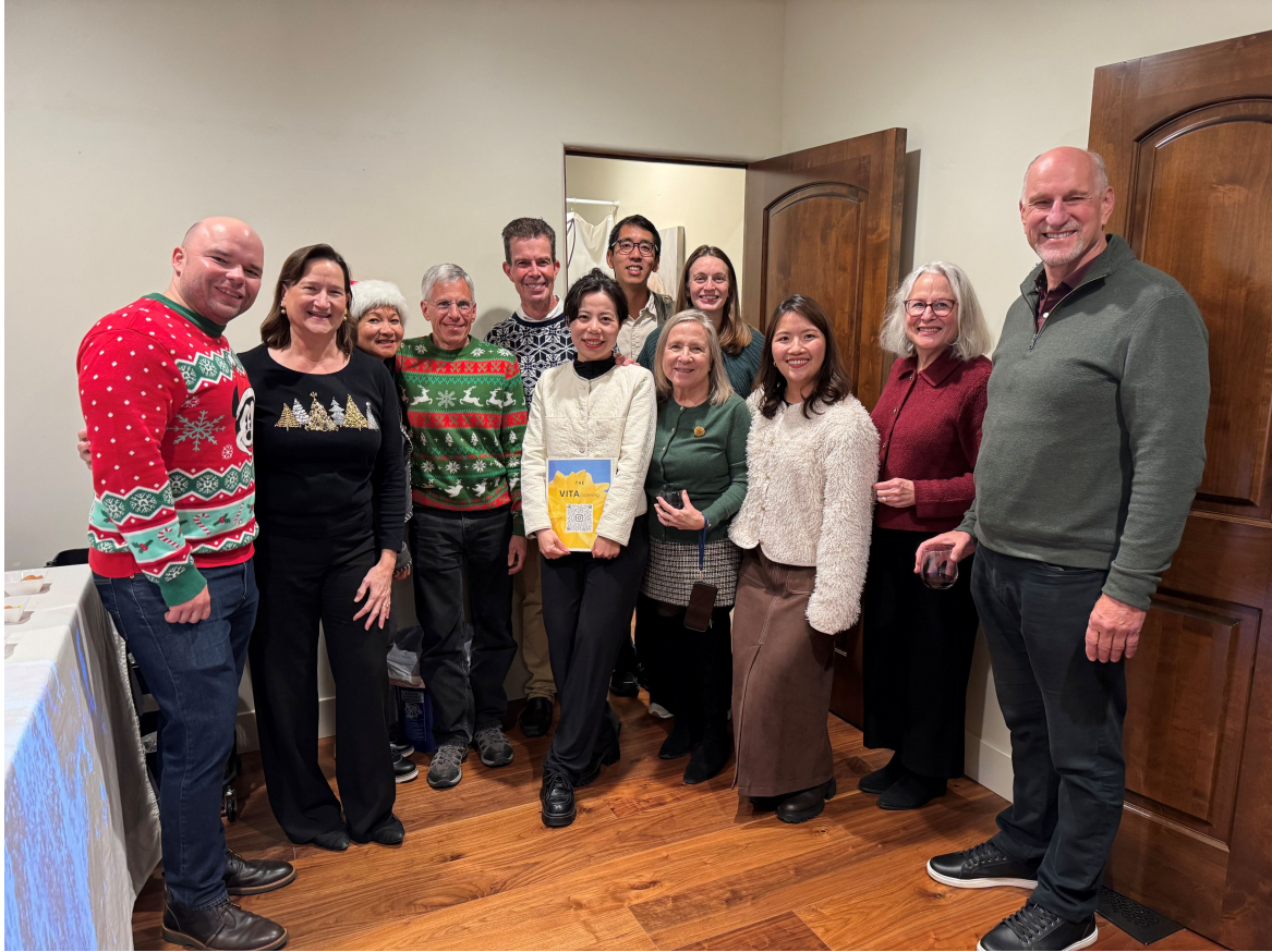
Neighbors Abroad + Palo Alto leaders + holiday cheer = an epic group photo.

Neighbors Abroad's 2025 Holiday Party was a wonderful way to close out the year, bringing together Palo Alto city leaders with Neighbors Abroad members and friends.