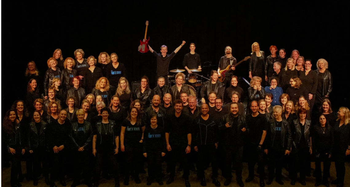
Rockkooor Enschede, a large rock cover choir from Enschede, was established approximately eight years ago.